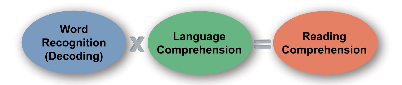
Figure 1. The Simple View of Reading

The Simple View of Reading<sup>9</sup> (Figure 1) and The Simple View of Writing<sup>10</sup> (Figure 3) are frameworks that will be used to define the learning progression for reading and writing. It is important to note the Simple View of Reading and Simple View of Writing are NOT simple. For example, the Simple View of Reading is a well-researched, thorough framework for understanding the variations in components that contribute to reading comprehension at any point in reading development for not only English-speaking readers but also for second language learners and dual-language users.<sup>11</sup> The Simple View of Reading states reading comprehension is the product of printed word recognition and language (linguistic) comprehension.<sup>12</sup> Because this model is a multiplicative explanation for the development of reading comprehension, at no point in the developmental learning progression should instruction focus exclusively on only one of the two parts. Although specific components of the Simple View of Reading are more relevant at different developmental periods (e.g., more emphasis on word reading initially and less emphasis overtime as students have developed more sophisticated and complex word reading abilities), instruction must effectively integrate the word recognition and language comprehension components.<sup>13</sup>