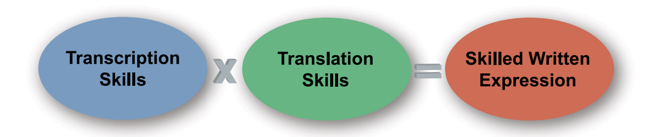
Figure 3. The Simple View of Writing

"Writing, like reading, is defined from a developmental standpoint.<sup>19</sup> It begins with the acquisition of foundational skills and then systematically leads to the application of more sophisticated techniques"<sup>20</sup>, like translation skills, to effectively organize and express ideas throughout the grades. Translation skills are grounded in oral language and its components, namely (a) vocabulary and semantics—language content, (b) grammar, morphology (the building blocks of meaning are including roots, prefixes, and suffixes) and syntax (the building blocks of sentences such as various phrasal and clausal structures)—language form, and (c) pragmatics (applying culturally-bound rules for using language effectively in diverse social contexts)—language use. At no time in the writing learning progression would an instructor focus on one part of the equation to the exclusion of the other part.